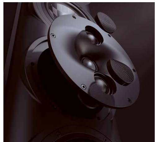
This is what the DPC array looks like, with the outer midrange drivers only coming out of their „holes“ for illustrative purposes here.

And yet we have to proclaim that the offered level of bouncy and rhythmic precision and fulminant force is unparalleled. Especially for standmount speakers. After all, the S5M does bring a lot of volume, which is easily sufficient for frequencies around 40 Hertz. In short: Wow!