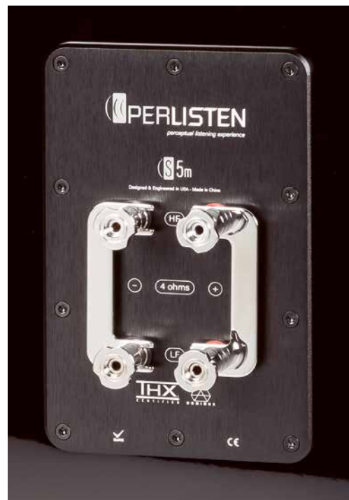
The bi-wiring terminal of the Perlisten Signature S5M is of course of high quality and is ready for uncompromising bi-amping.