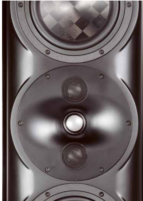
The proprietary design with three domes and waveguide is functionally reminiscent of D'Appolito and is intended to minimize room influences.

The amount of direct sound is correspondingly high here. Meticulous phase stability as well as the geometric layout are important in this design, because correct time alignment and linearity are of great importance and determine the desired degree of precision and plasticity. You might indeed be reminded of the well-known, traffic light-like „D'Appolito configuration“ with just one dome tweeter and two cones. You wouldn't be entirely wrong with that; but all three drivers, their lower moving masses and the corresponding rise times are much closer together here. Not to forget that Perlisten Audio also holds some patents for its proprietary array. Of course, the competitor M&K also offers three tweeters, every cinema fan knows that – but still, everything is rather different here.